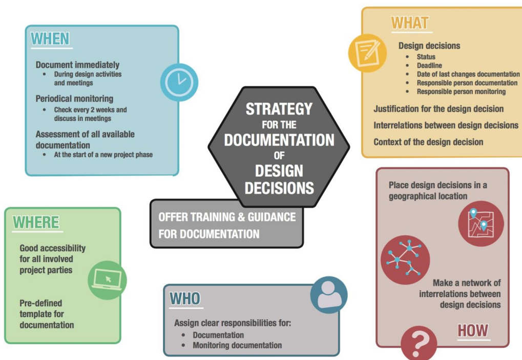
Figure 1. The concept strategy, showing all elements

The assessment of all available documentation at the start of a new project phase is addressed. This is included in the last level as findings indicate that performing this effectively could only be achieved if the assessors have a good understanding of what documentation should be available and what quality this should have. It is important that all design activities are postponed until the assessment is finished.